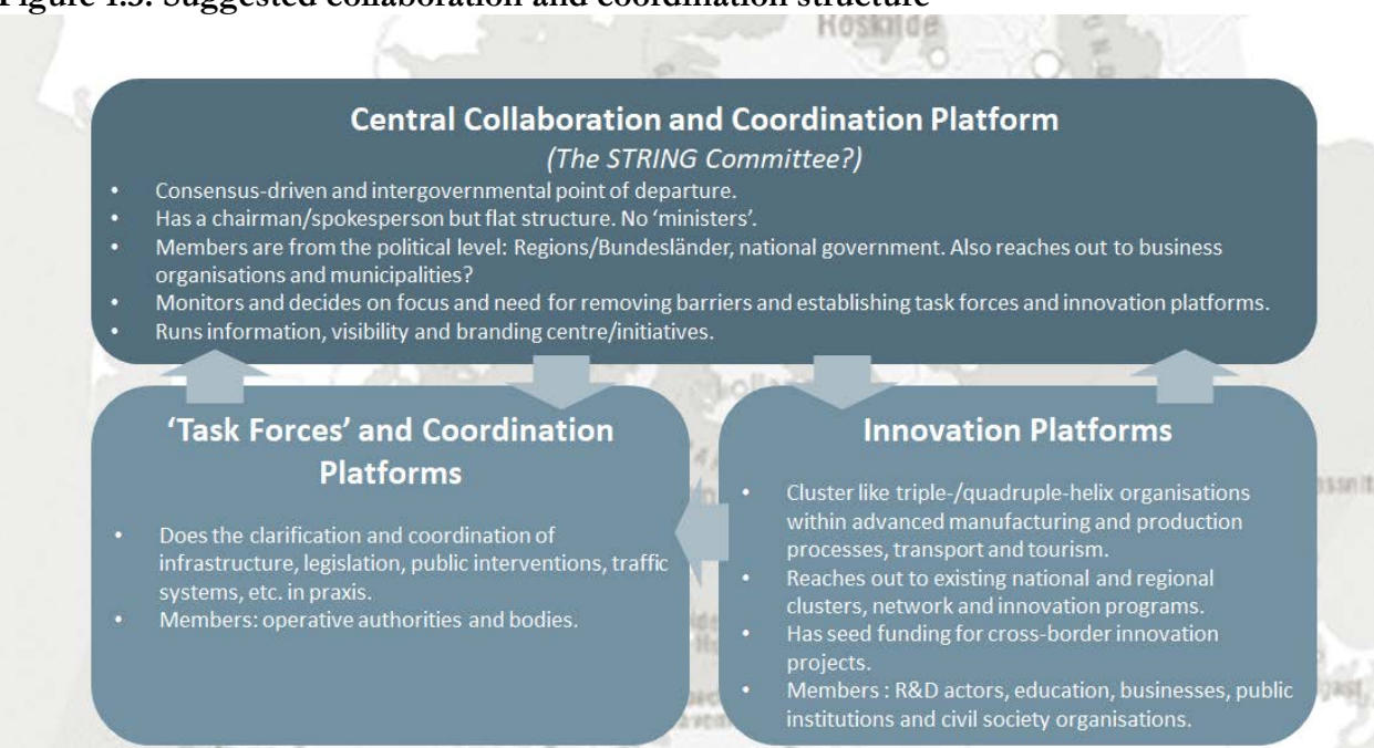
Figure 1.3: Suggested collaboration and coordination structure

Based on the analysis, we have identified three levels of interacting platforms that would be essential to address when it comes to overcoming barriers and exploiting potential and possibilities: 1) a central collaboration and coordination platform deciding on the overall focus of collaboration, 2) technical task forces and coordination platforms working on coordination and synchronisation of infrastructure and regulations at operational level, and lastly, 3) innovation platforms gathering academia, R&D facilities, businesses, public institutions and civil society organisations.